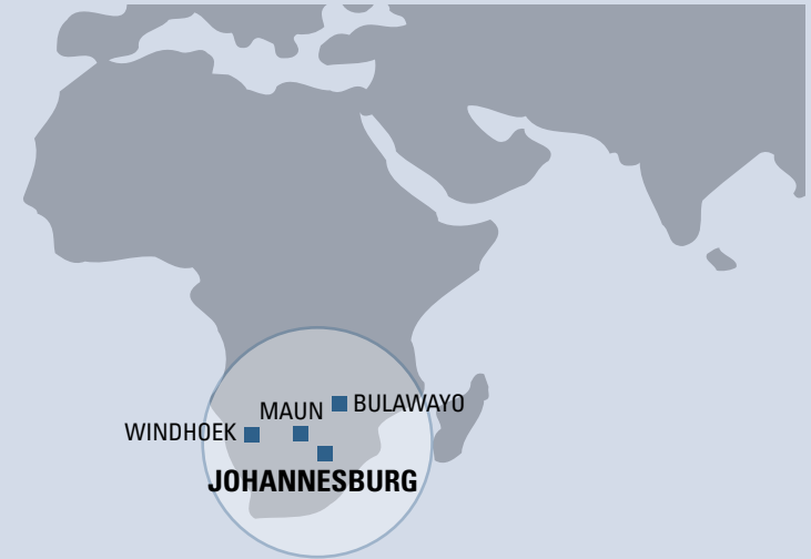
CESSNA 208 CARAVAN RANGE OUT OF JOHANNESBURG