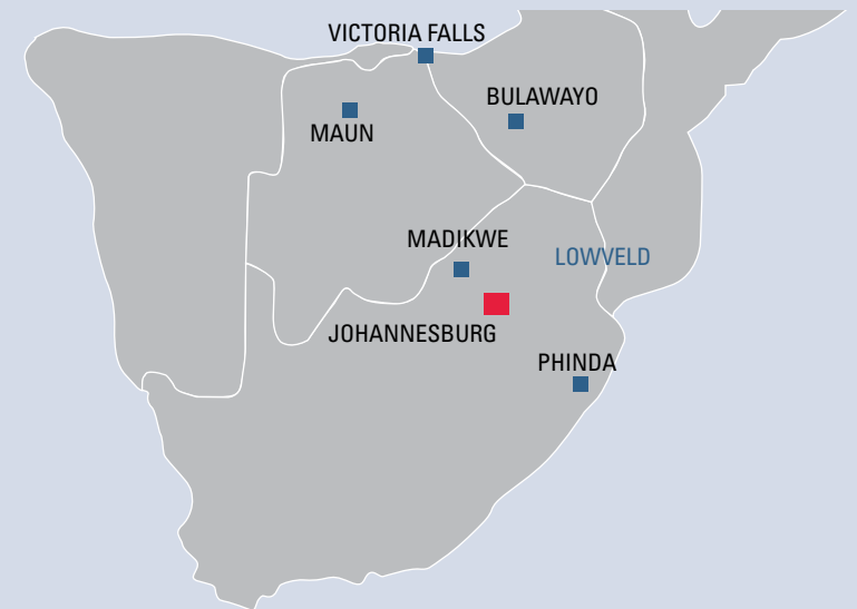
PIPER PA-31 NAVAJO RANGE FROM ORT TO PHINDA