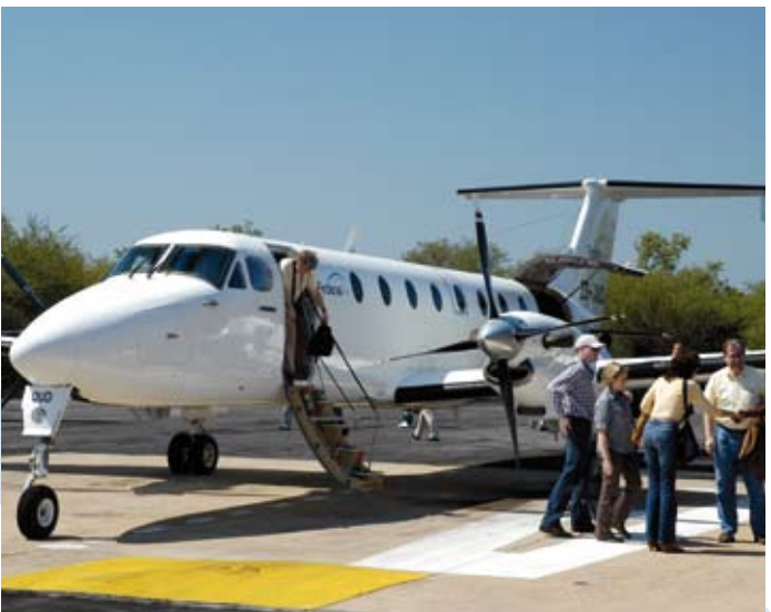
Arrival at bush game lodge